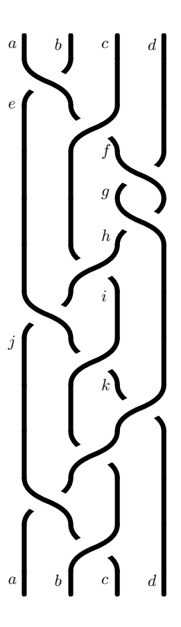
FIGURE 1. A braid whose closure is the knot K = 10_{164} with the Wirtinger generators for the knot group \pi_K .

However, it is not possible to choose f(t) \in \mathbb{Z}[t^{\pm 1}] , since \mathbb{Z}[t^{\pm 1}] is a UFD and both (t^2 - 3) and (3t^2 - 1) are irreducible. This gives the desired counterexample to Conjecture B (1).